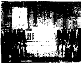
CHURCH INTERIOR 1940