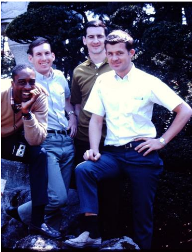
Figure 6 At a temple

We played baseball during the summer, I lost my glove at one game. It was the one I had used in high school and I was somewhat sad to lose it. We played cards in the barracks often, I learned how to play double deck pinochle. It was a skill that I used to win a pinochle tournament at MSUM years later. We even went to the local bars, got drunk a few times and generally had a good time.