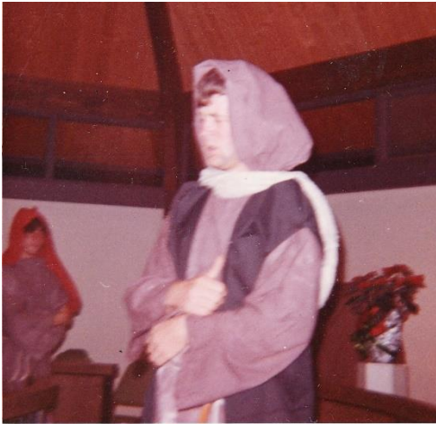
Figure 1 Playing a shepherd

Near Bloomington was Brown County park. By the lake in the park were picnic areas. Several nice afternoons and evenings were spent in the park. As we spent more time in