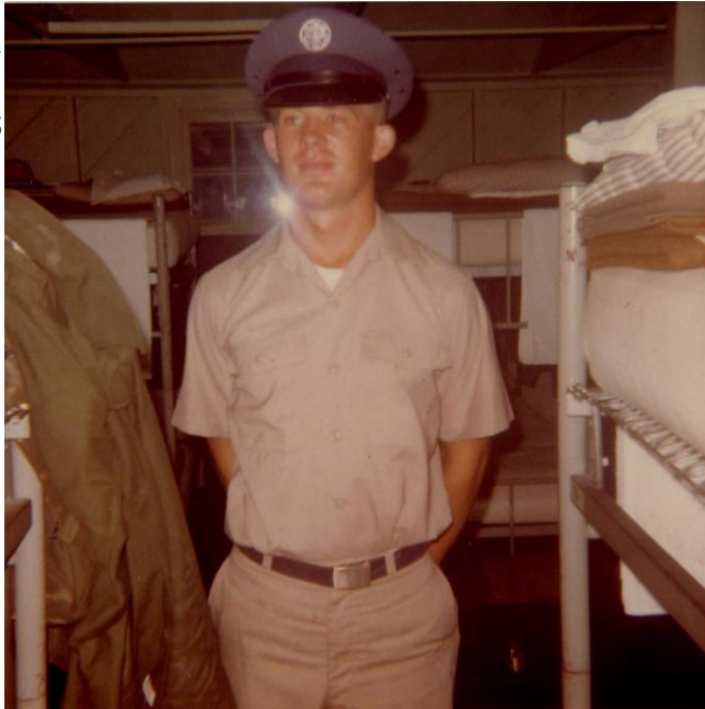
Illustration 2: In the barracks

Only two of us in my flight taking the test that day passed. As soon as our drill sergeant learned that the two of us were going to language school, he changed his treatment of us. I never received another demerit the rest of my basic training. I learned later that the drill sergeants had orders to not hold language school people back. Between the time I qualified for language school and enrollment at Indiana University