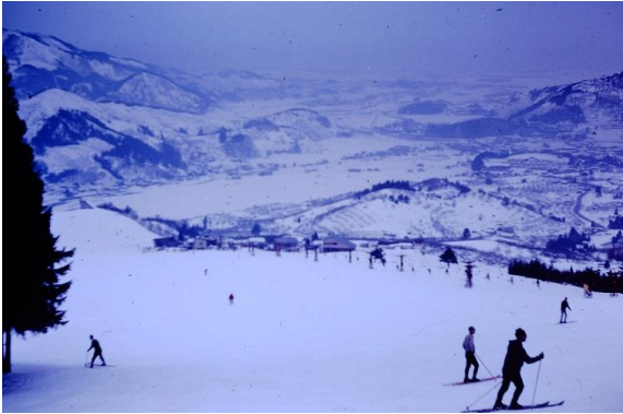
Illustration 5: Skiing at Owani

base. A couple times each winter we went to a mountain ski area and did our best to match the locals in ability.