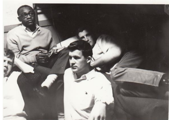
Figure 7 In the barracks