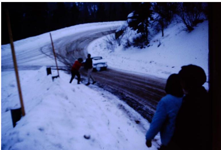
Illustration 3: Christmas 1965 in the mountains near Albuquerque, NM

While at Goodfellow, I purchased my first of several motorcycles, a Honda 300 Dream. Along with several other bike riders, we rode around the countryside, with the best place to ride being in dry riverbeds. I rode the Honda back to Minnesota following my training. Goodfellow was the first place I experienced the USO, there was a USO building in the town where we could get away somewhat from the military. People at the USO were nearly all volunteers, some spouses of men stationed there and some local volunteers, mostly women.