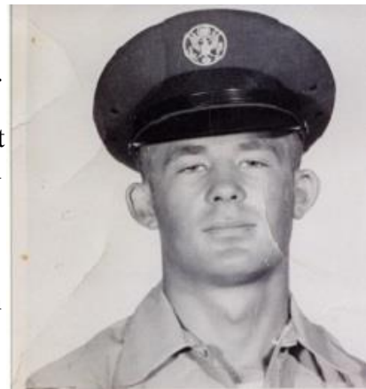
Illustration 1: Official Air Force Photo

mid-afternoon and arrived at Lackland near midnight. We were processed in, collected our clothing and taken to a barracks. It was about 2:00 am before we got to bed. Just before I fell asleep, I thought to myself 'What the heck have I done to myself now?' After thinking about it a few minutes, I realized that thousands of other men had done the same thing and if they could do it, so could I. During those few minutes I had my only regrets about joining the Air Force. The next day arrived about 5:15 am with assembly at 5:30, then off to breakfast. We then went to the barber shop for a haircut. As with everyone else who has ever gone to basic training, the hair cut was something. It took all of two minutes and we all looked alike. Of course, the barbers had fun asking what type of cut we wanted or did we want the part on the right or left. Then they shaved it all off!