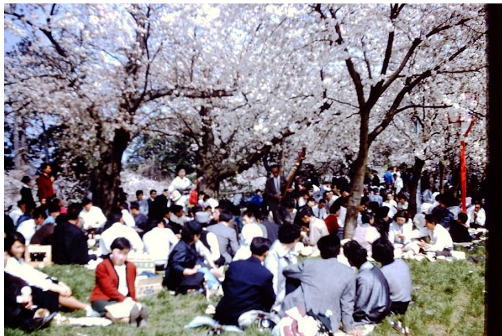
Illustration 4: Cherry Blossom Festival in Amori, Japan

Each year we also took an organized trip to one of the big cherry blossom festivals. I later was at the one in Washington, D.C but the one in Japan were much better, the cherry trees were everywhere. The cherry trees in D.C. were a gift from Mayor Ozaki of Tokyo City in 1912. Mayor Ozaki donated the trees to enhance the growing friendship between the United States and Japan and also celebrate the continued close relationship between the two nations.