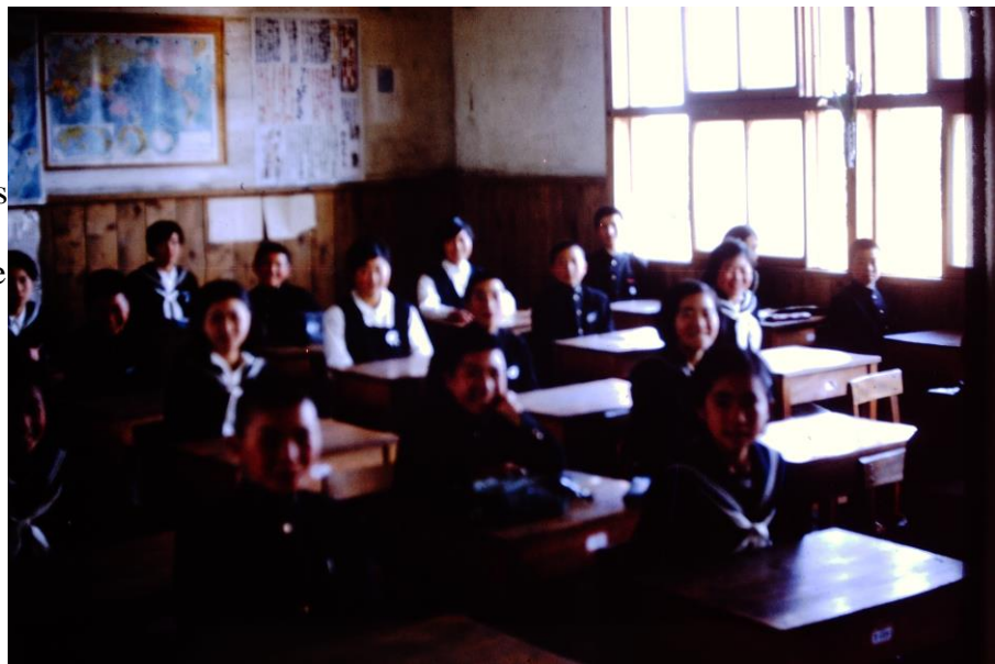
Figure 5 My class in Japan

I had another opportunity to interact with the local people. One of the local junior high schools posted a notice that they were looking for Americans to help tutor their students in English. Again, I forgot the military rule about volunteering and volunteered. For a couple months I either took a train or rode my motorcycle to a nearby town and did volunteer work. I would read from books in English during class time and the teacher would record them for use later. For all I know, they may be still using the recordings. The most interesting time was during