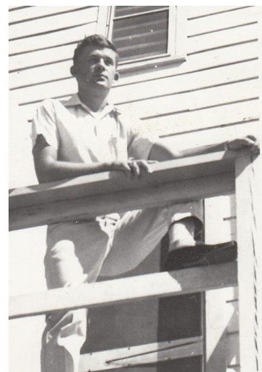
Figure 2 Outside the barracks at Goodfellow

Following graduation, we were given orders to report to Goodfellow Air Force Base in San Angelo, TX. Several of our class took the opportunity to go on leave back home, but I didn't. One of my classmates suggested that I go with him to his home in Texas and then on to San Angelo. He wanted to see his girlfriend, who was only sixteen years old. They were married later that year. Since he wanted to spend time with her, he set me up with a blind date and we went to a drive-in movie. She was also sixteen, married to a soldier in Vietnam and was about eight weeks pregnant. I learned that women married young in Texas. Since he lived close to Ft Worth, TX, we went to my first strip club.