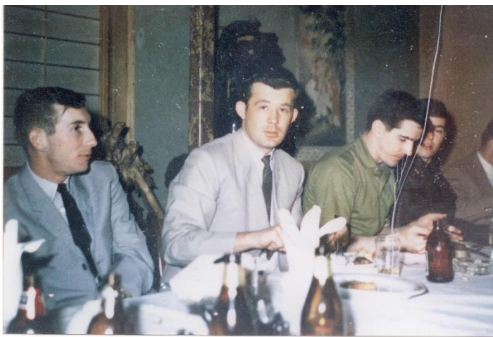
Figure 8 Going Away from Misawa

During the final few months, I started thinking about what I would do when got out of the Air Force. I did have a re-enlistment briefing where I was offered the equivalent of a year's salary as a re-enlistment bonus plus my choice of my next assignment. I turned it down because I didn't want someone else telling me what to do, when to do it and where to do it. I knew I could return to MSUM, but started looking at other colleges. After some searching, I decided that Western Washington State University would be a good place for me, so I applied and was accepted for the fall term. I stopped for a visit on the way back home and liked the campus.